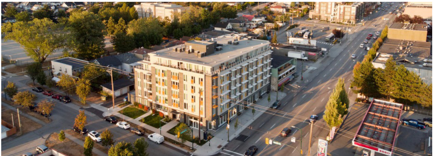
The Heights, Cornerstone Architecture