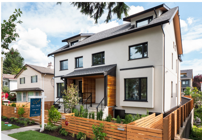
Futrhaus, b Squared Architecture Inc.

For all other Part 9 buildings, the VBBL has prescriptive requirements for each major building assembly (e.g. foundation, walls, floors, and roof) and each type of enclosure, including doors and windows. For each building assembly category, the minimum effective thermal resistance or R-Values (m 2 K/W) are specified. Similarly, for each exterior enclosure category, the maximum thermal transmittance or U-values (W/m 2 K) are specified. Further details can be found in the Energy and Water-Efficiency chapter (Part 10) of the 2019 VBBL , in the Design Measures for Energy Efficiency section (see Table 10.2.2.6 and Table 10.2.2.7).