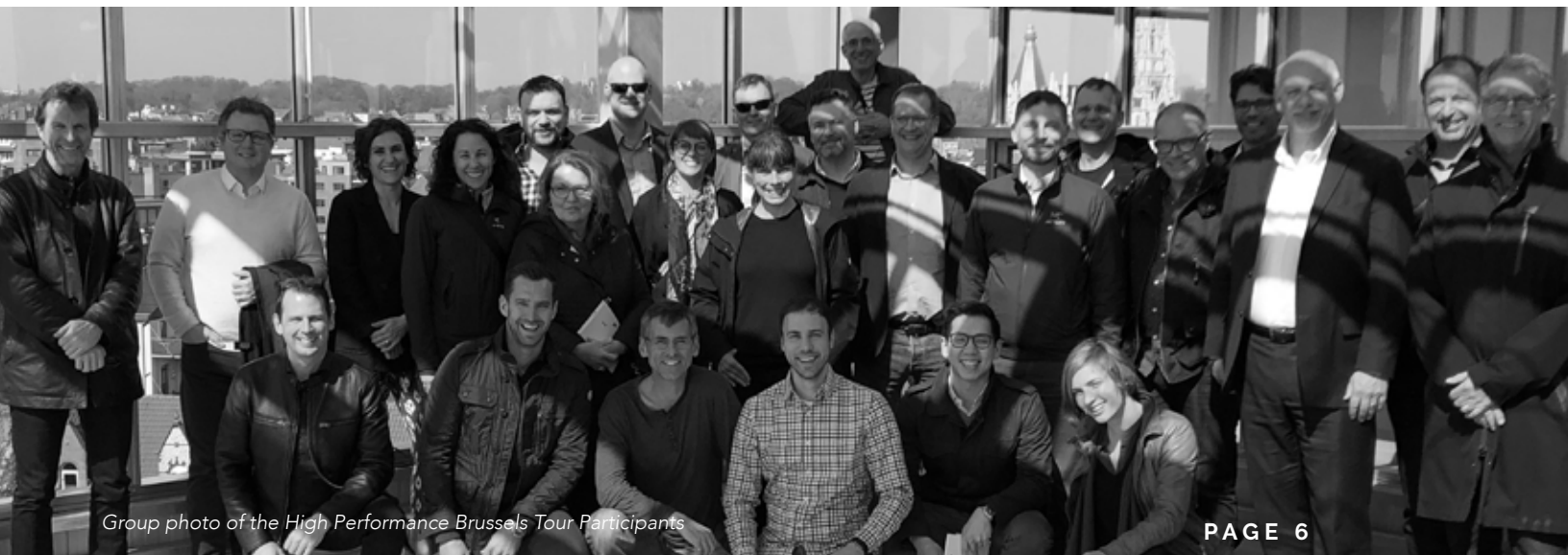
Group photo of the High Performance Brussels Tour Participants

As ZEBx continues to develop relationships with leaders and governments worldwide, the organization is well positioned to connect local industry to innovation and best practices from around the world. Our networks extend to Brussels, Belgium – a region that has undergone a renaissance in building performance in the last 12 years, and since 2015, has required all buildings to meet Passive House levels of performance. Through our partnerships, ZEBx was able to lead a unique learning opportunity in Brussels for 25 of Vancouver's top development and real estate influencers, visiting many high performance buildings and gaining access to insights around policy, design and construction.