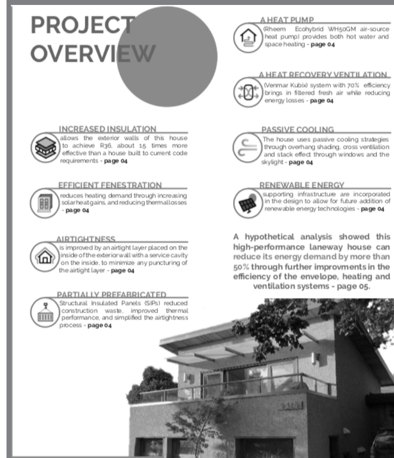
ZEBx's standardized case study: executive summary page.