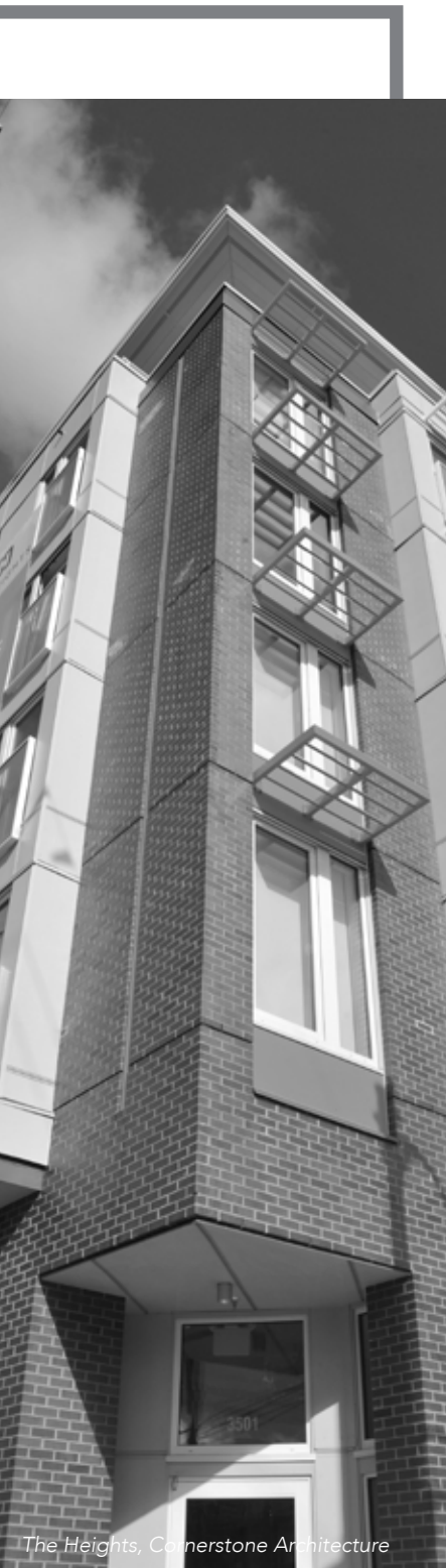
The Heights, Cornerstone Architecture